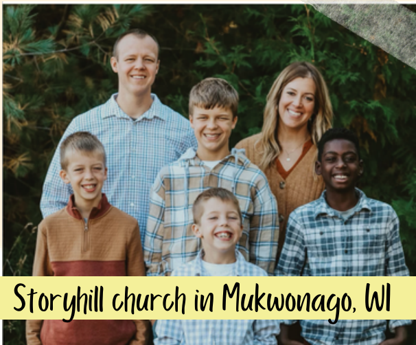
Storyhill church in Mukwonago, WI