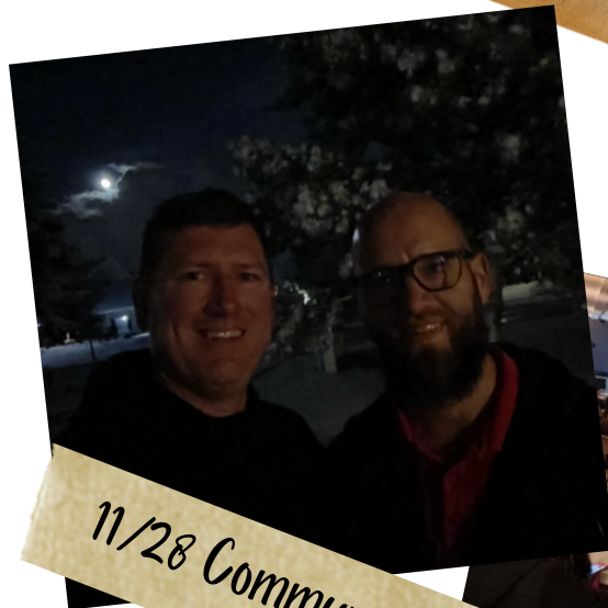
11/28 Community in Oak Creek, WI