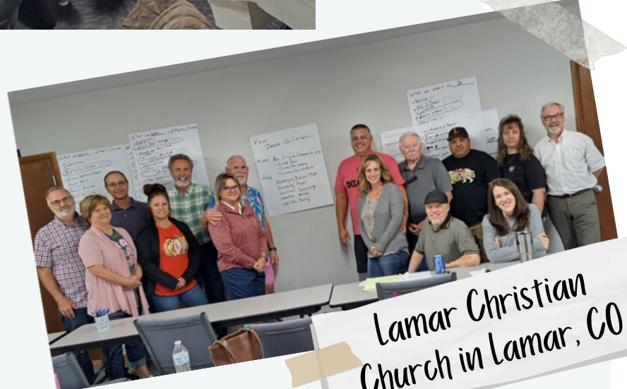
Lamar Christian Church in Lamar, CO