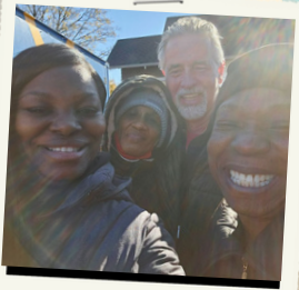
Revive Church in Milwaukee, WI

Crossroads is currently supporting 2 churches with a total of 4 church plants in 2023! This includes assisting the launch of Revive Church